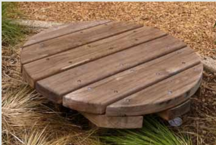
7. PLATFORM SEATS