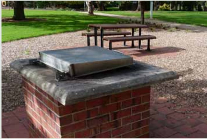
5. BARBEQUE AND PICNIC TABLE