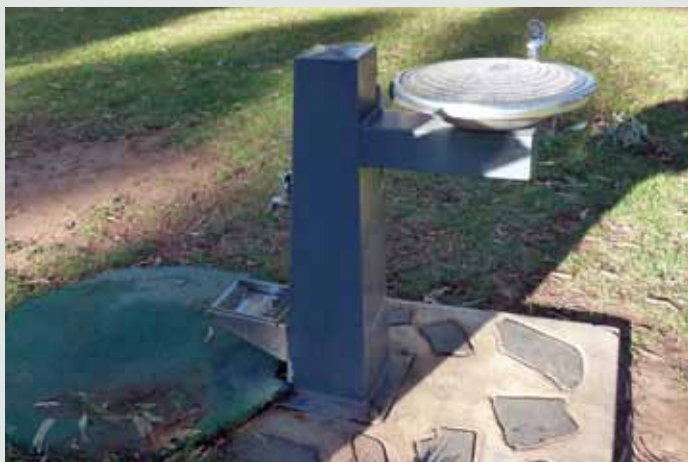
6. DRINKING FOUNTAIN WITH DOG BOWL