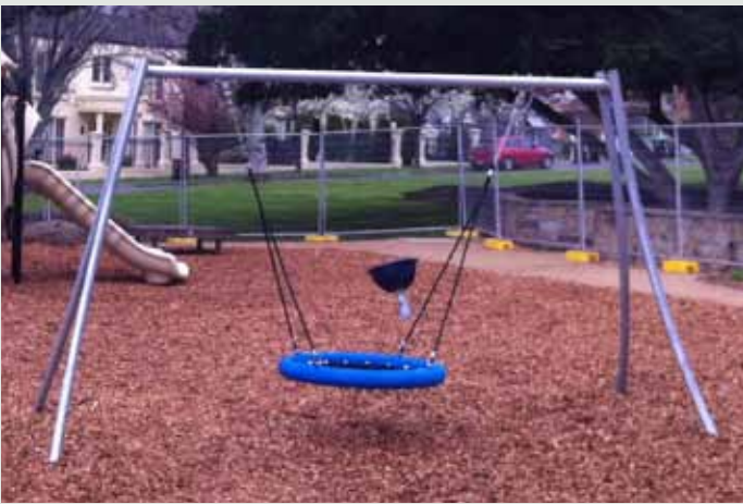
1. BIRDS NEST SWING

DESIGN STATEMENT: This playspace mixes traditional play equipment pieces with natural elements and changing levels to create an interactive environment for children while catering for the needs of carers and other park users. A meandering dry creek bed, grass mounds, stepping stones and pathways link the play equipment to create a linked space. Natural shade is used to protect the play spaces as well as a fitness equipment and barbeque/ picnic area. Other amenities include a drinking fountain, formal and informal seating, tree uplighting and upgraded pathways while allowing for open grassed space.