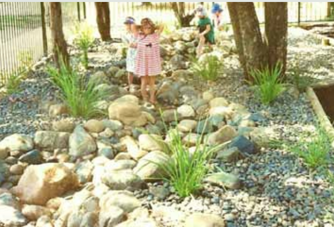
9. DRY CREEK BED WITH BRIDGE