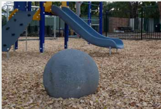
4. CONCRETE SPHERES