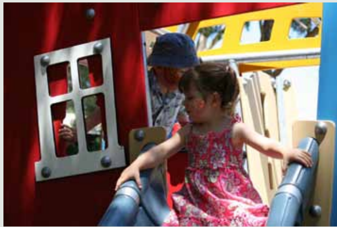
2. TODDLER'S SLIDE AND PLAY PIECE