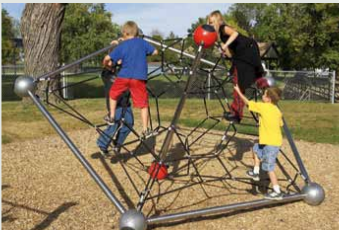
2. CLIMBING FRAME