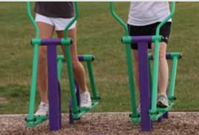
10. OUTDOOR FITNESS EQUIPMENT