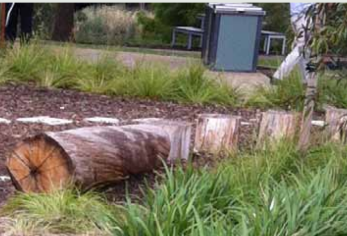
8. NATURAL STEPPING STONES